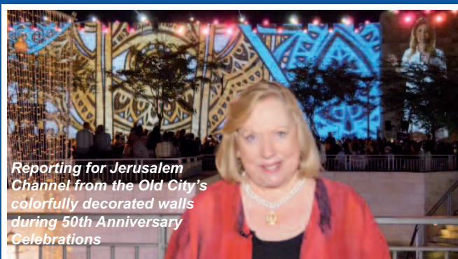
Reporting for Jerusalem Channel from the Old City's colorfully decorated walls during 50th Anniversary Celebrations

The atmosphere of Jerusalem in this Jubilee Year is best summed up by Isaiah 66:10, "Rejoice, Jerusalem, and all who love her, celebrate! And all you who have shed tears over her, join in the happy singing."