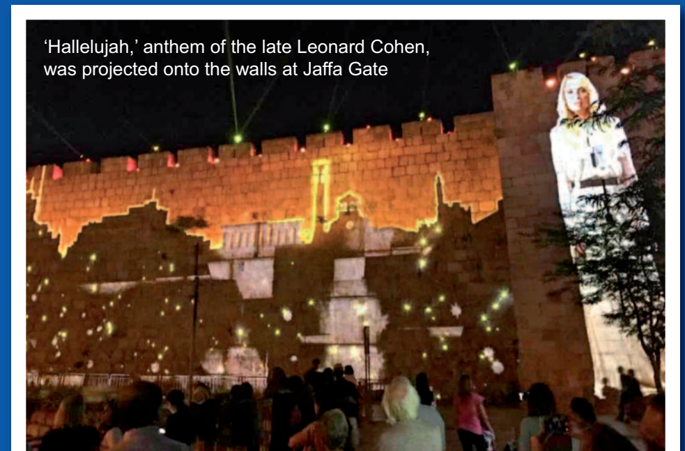
'Hallelujah,' anthem of the late Leonard Cohen, was projected onto the walls at Jaffa Gate

Moreover, in Isaiah 19, God's intended confederacy for the region is clearly stated. He promises to heal Egypt, whom he calls "My People," to restore Assyria {ancient Asshur},