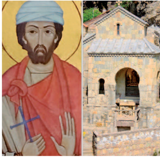
St. Abo and a church named in his honor in Tbilisi, the capital of Georgia

A highlight of our journey to the ancient Christian nation of Georgia was the discovery of St. Abo, considered to be the patron saint of Tbilisi, Georgia's capital. We were visiting a church and my husband saw an icon (photo above) of a