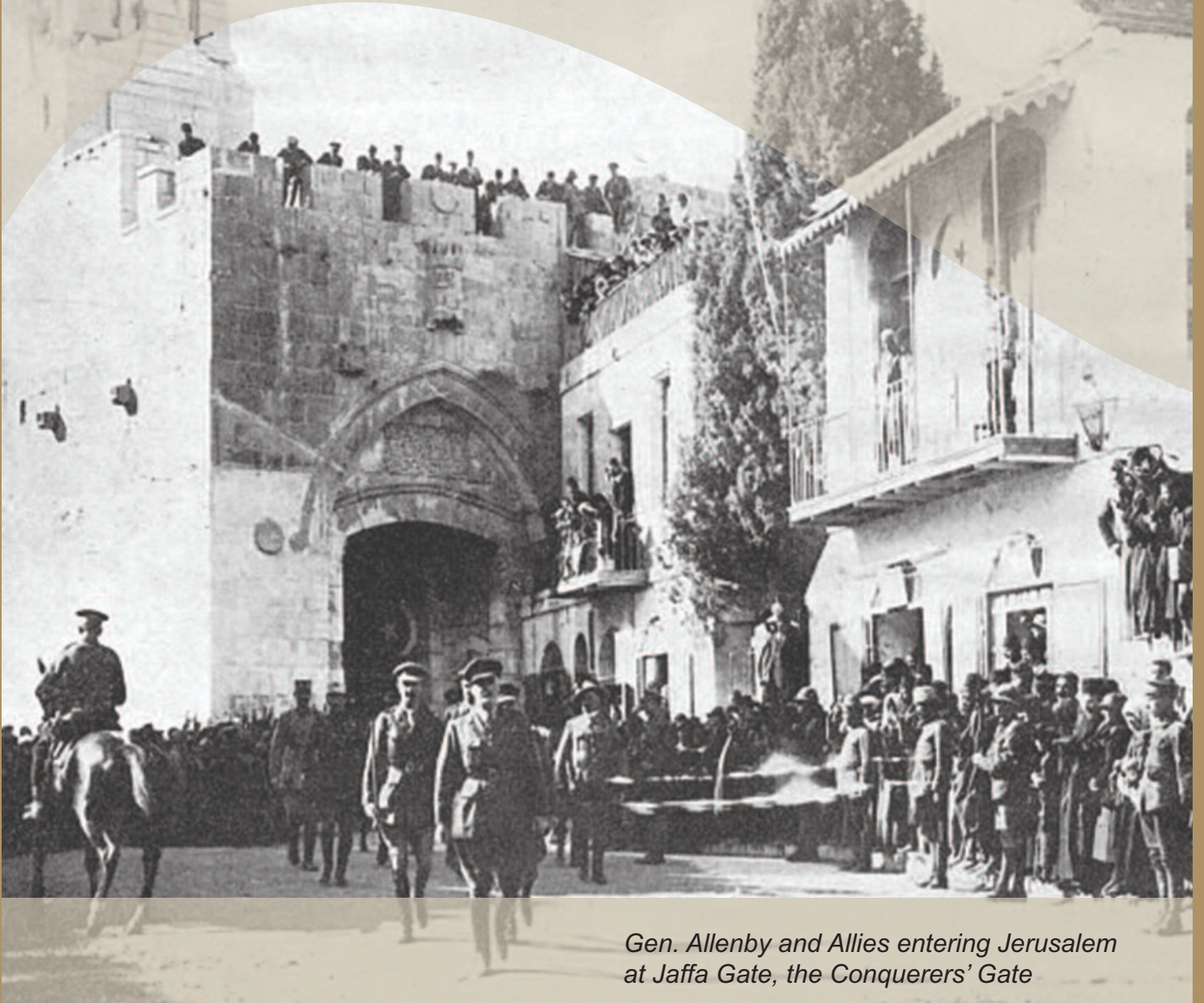
Gen. Allenby and Allies entering Jerusalem at Jaffa Gate, the Conquerers' Gate