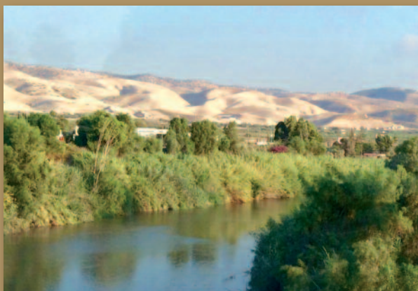
Crossing the Jordan River